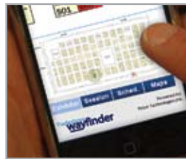
Mobile browser app