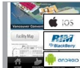
iPhone, iPad, Android, RIM apps